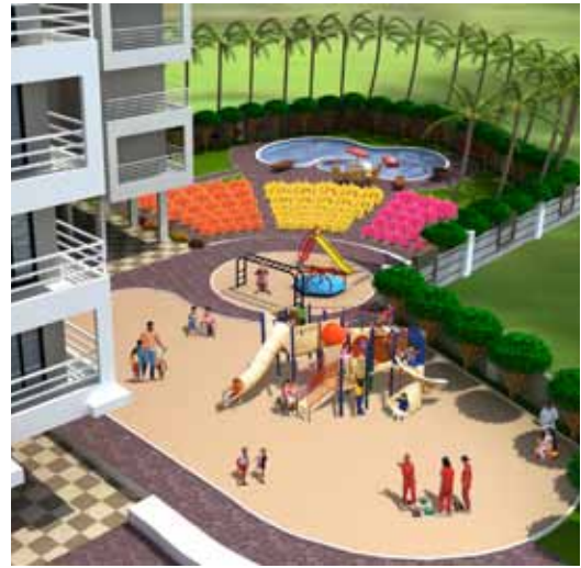
Swimming Pool & Children's Park