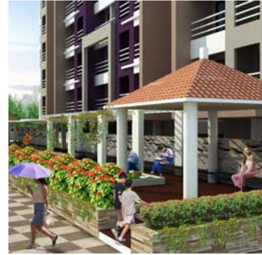
Garden & Sitting Area